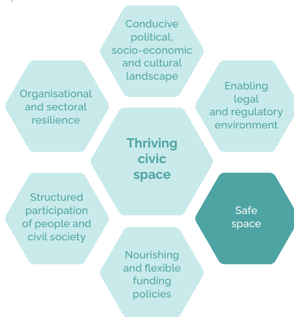
Figure 1 - FRA (2023) How to support civil society under pressure