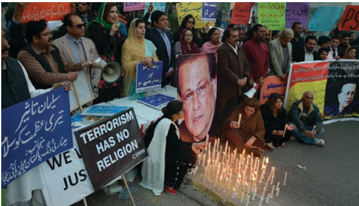
Pakistani civil society activists light candles on the anniversary of the death of the governor of Punjab province Salmaan Taseer in Lahore on January 4, 2016.

available, including death sentences, especially in murder and blasphemy cases. In particularly high-profile cases, it is not unusual for mobs to be present outside the courtroom, resulting in judges fearing for their own safety should they acquit the defendants, even when the weakness of the evidence merits an acquittal.