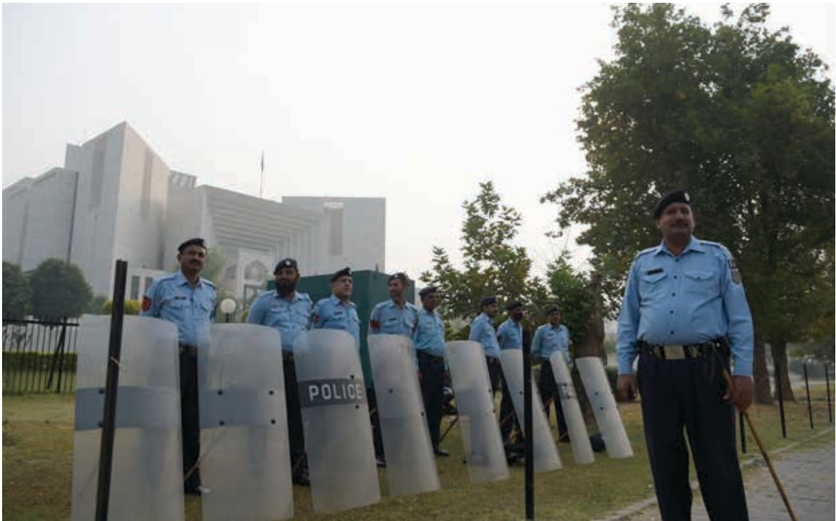
Pakistani policemen stand guard outside the Supreme Court building in Islamabad on 31 October 2018.

This rush to investigate and arrest is in part due to concerns that the community may resort to their own means to punish the alleged perpetrators. These fears are not unfounded. Since 1990 to August 2018, almost 70 people have been lynched after having been accused of committing blasphemy. 52