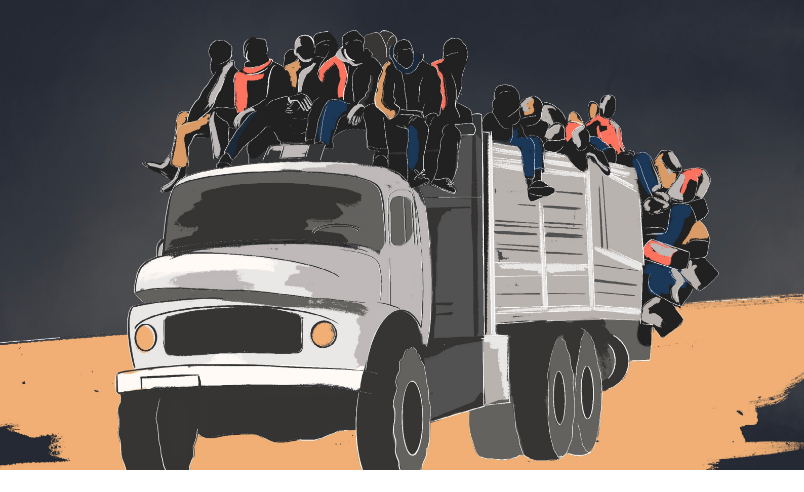
being held". As many as 100 people may have died, while numerous others were injured. Detaining migrants and refugees near weapons and ammunition stores is a dangerous but widespread practice in Libya.