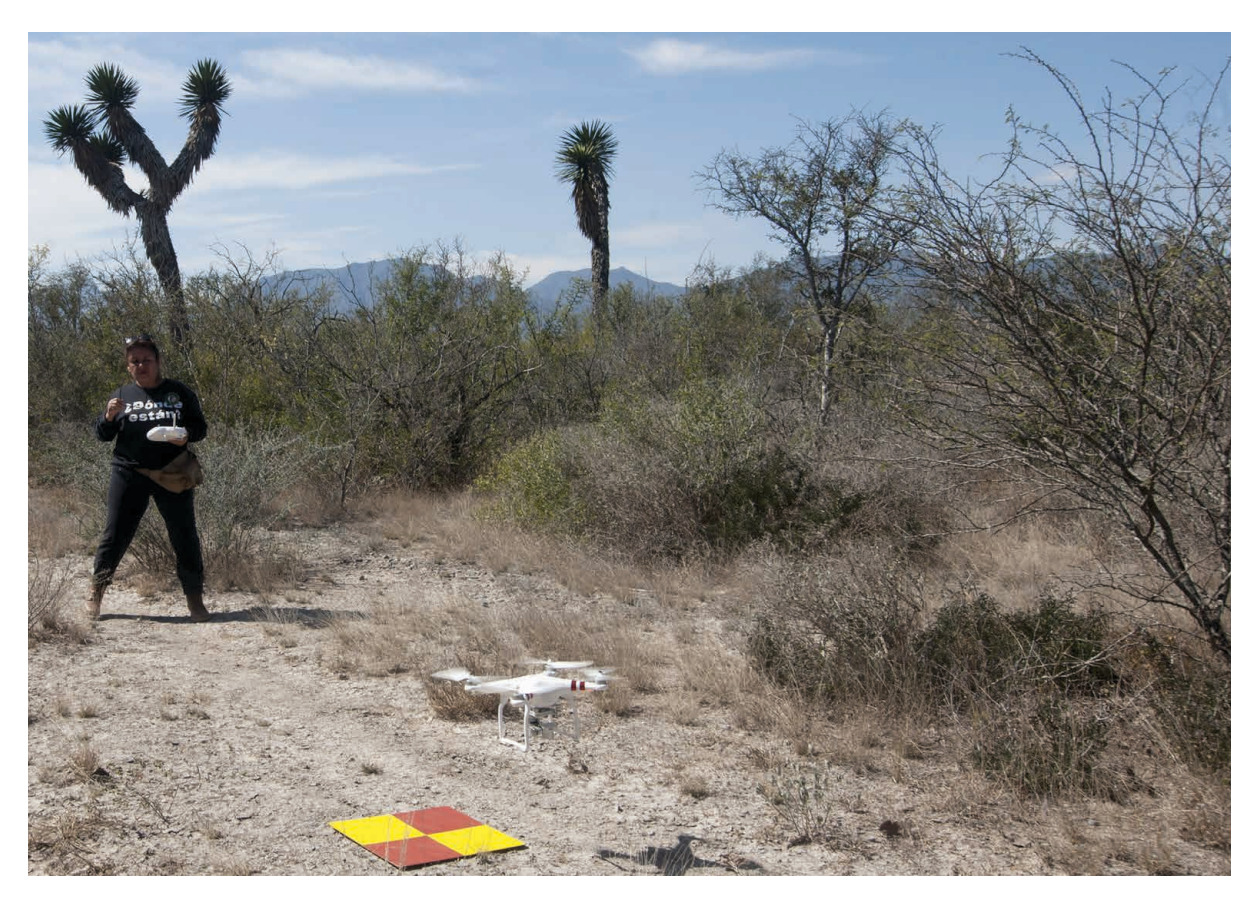
Leticia Hidalgo, member of Fuerzas Unidas por Nuestros Desaparecidos en Nuevo León (FUNDENL) prepares a drone to search for missing person remains trough ortho photogrammetry- to fly over the «Las Abejas» cooperative land, in the municipality of Salinas Victoria, Nuevo León state, on February 24, 2020.

It was not until August 2019 that the Ministry of the Interior stated that, since 2006, 4,974 bodies had been located in 3,024 clandestine graves;<sup>14</sup> nevertheless, in January of 2020, the Ministry of the Interior warned that the final count is 3,631 clandestine graves.<sup>15</sup> From December 2018 to January 2020, 873 graves and 1,124 bodies were located.<sup>16</sup> In other words, on average two graves are being located per day in Mexico. In contrast, due to the discovery of the clandestine graves, only 381 investigation files have been opened and only 59 people have been punished.<sup>17</sup>