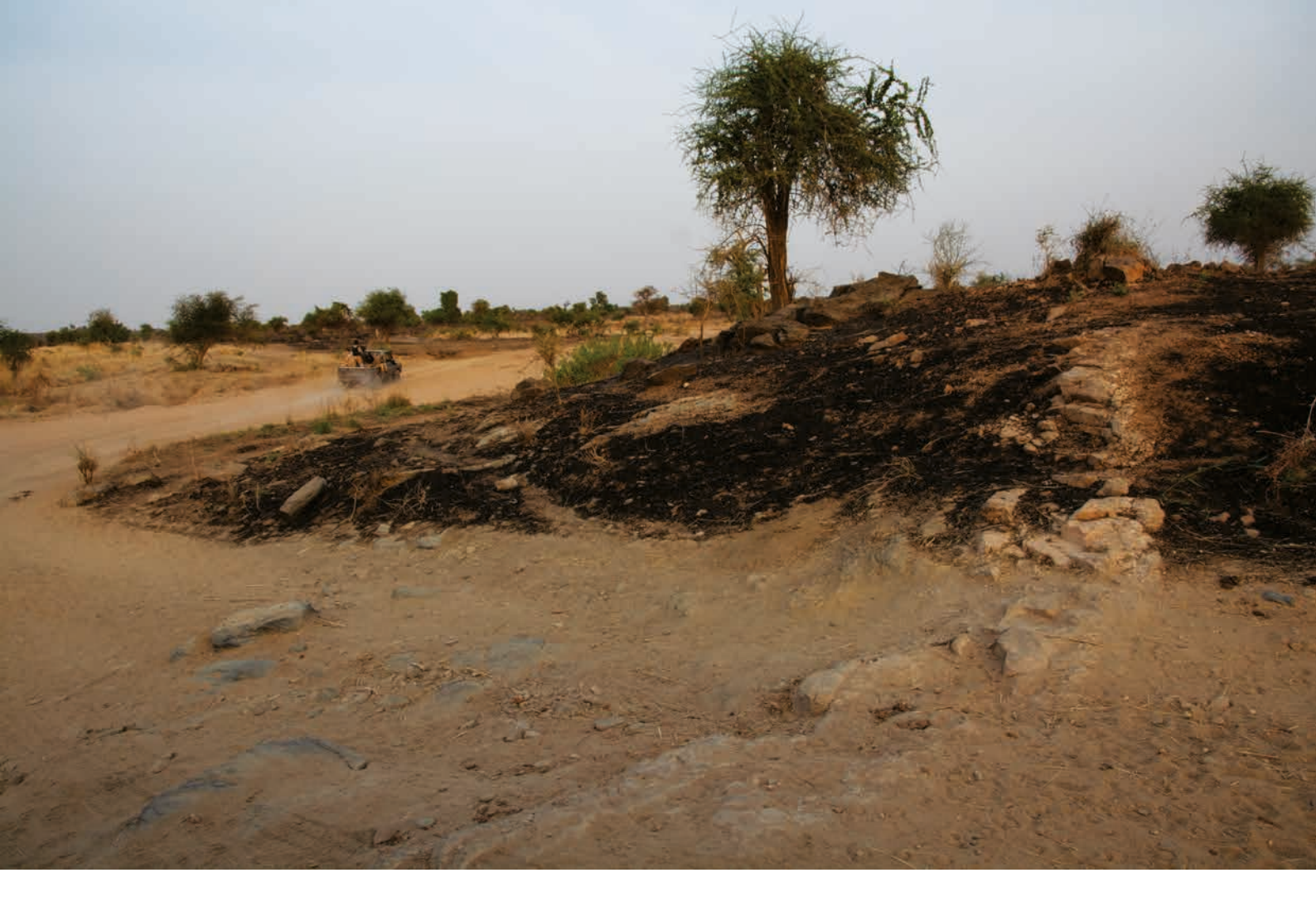
After a series of attacks by armed Arab pastoralists, Masalit villagers burnt the grass in order to deter the pastoralists from coming to their area, but this also contributed to tensions. Misterei locality, West Darfur, February 2021.