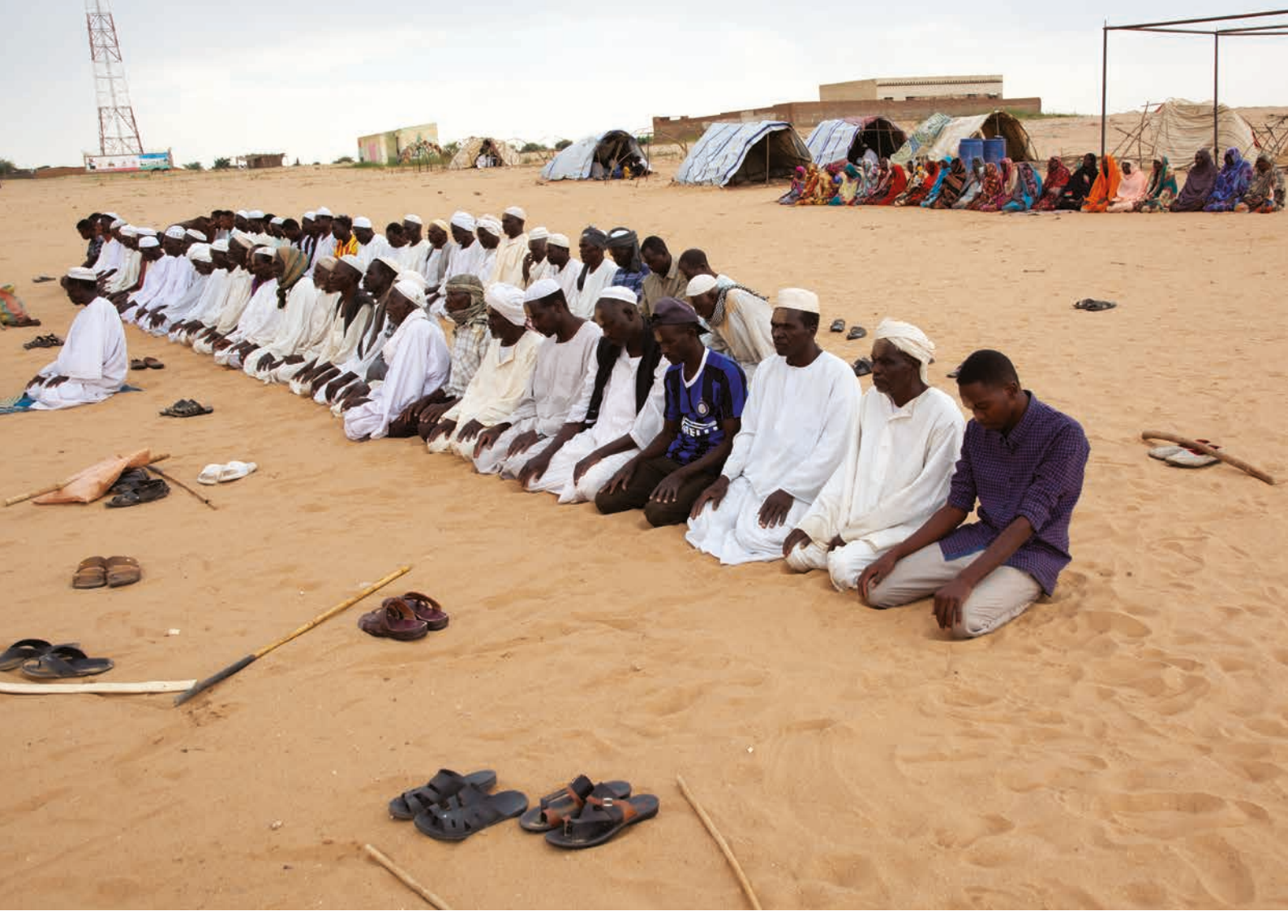
Each evening in Fatta Borno, inhabitants pray at the location of the sit-in for the ten protesters who were killed. North Darfur, October 2020.