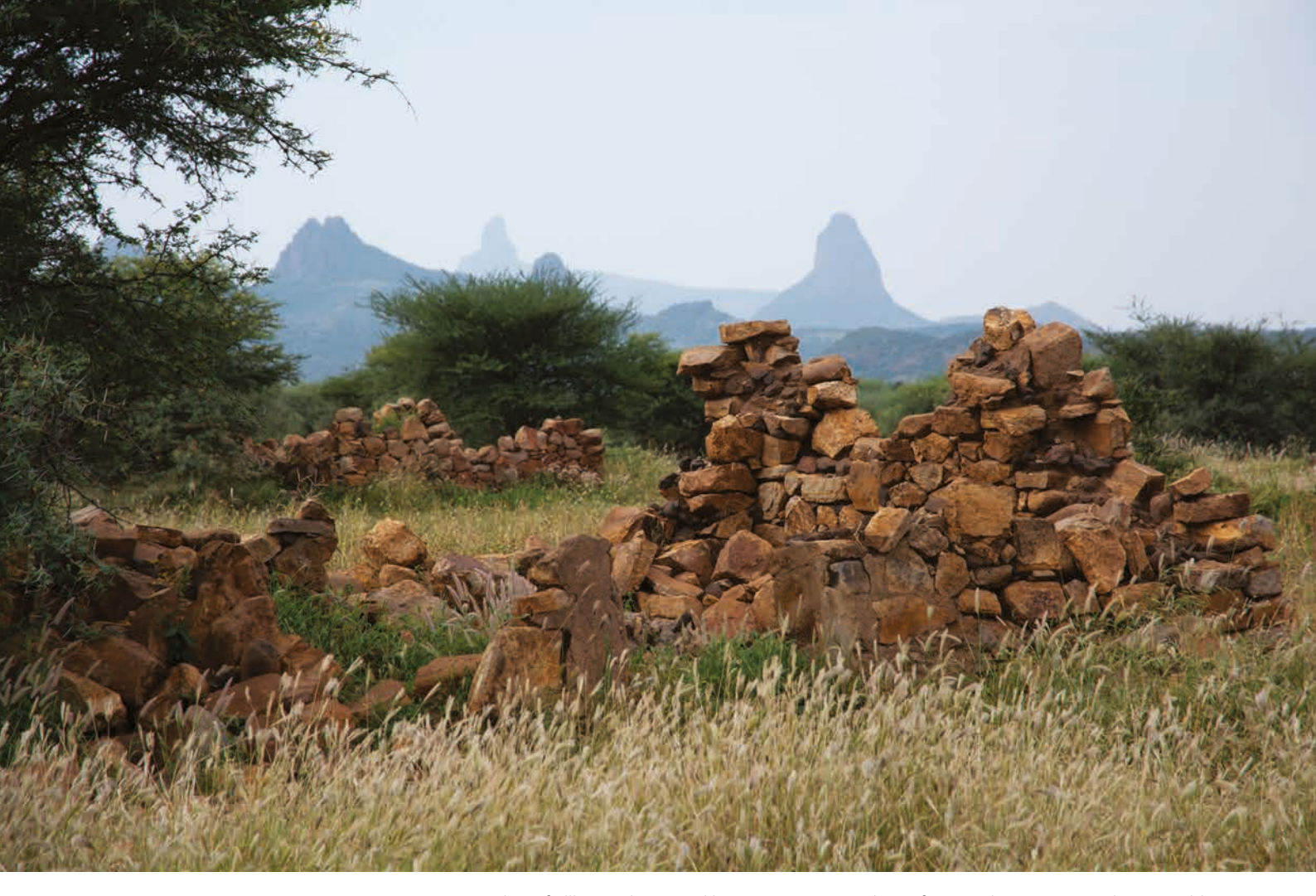
Ruins of villages destroyed in 2003/2004, North Darfur, October 2020.

In 2005, the UNSC referred the situation in Darfur to the ICC. Between 2007 and 2014, the Court delivered arrest warrants against five suspects: