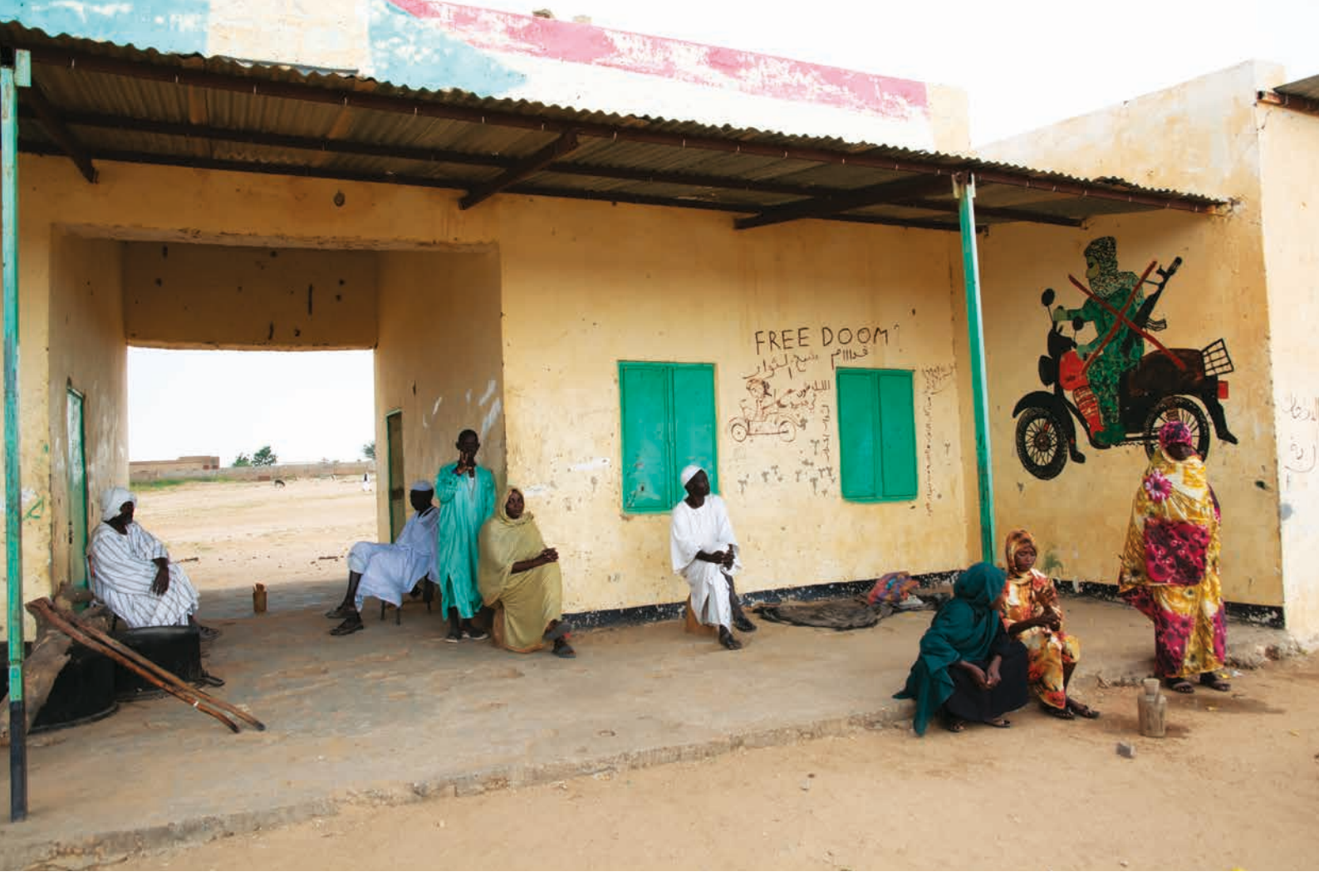
Inhabitants of Fatta Borno in front of a mural protesting against the presence of Arab militias riding motorbikes, frequently attacking the village and the farmers who dare to leave it. North Darfur, October 2020.