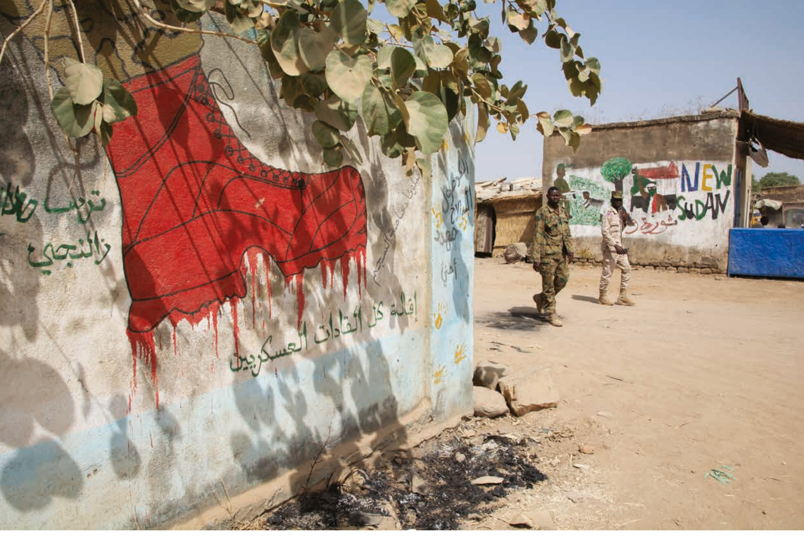
Revolutionary murals painted during the sit-in in Nyertiti, Central Darfur, in mid-2020.