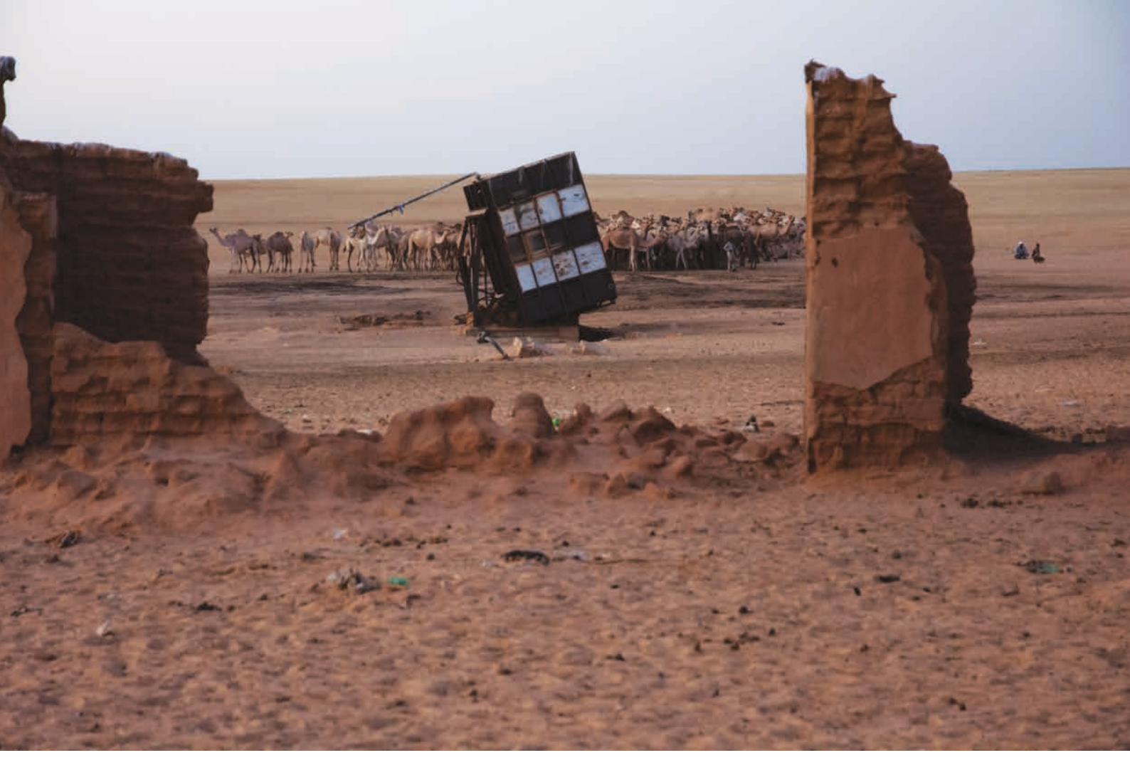
Wakheim water station was a crucial staging point for both Arab and Zaghawa nomads at the edge of the Sahara. It was controlled by Zaghawa rebels between 2003 and 2015. Arab janjawid militias, including under Hemetti's leadership, attacked it several times and destroyed the station. Since 2015, Arab nomads have returned to the area. North Darfur, October 2020.