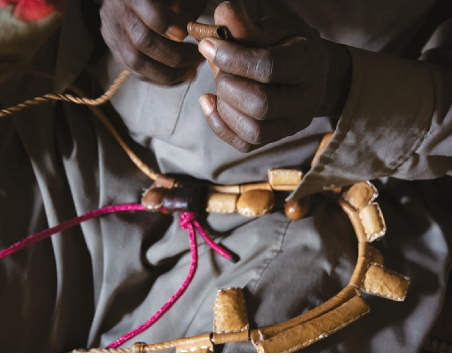
A Masalit self-defence fighter making protective charms, West Darfur, February 2021.