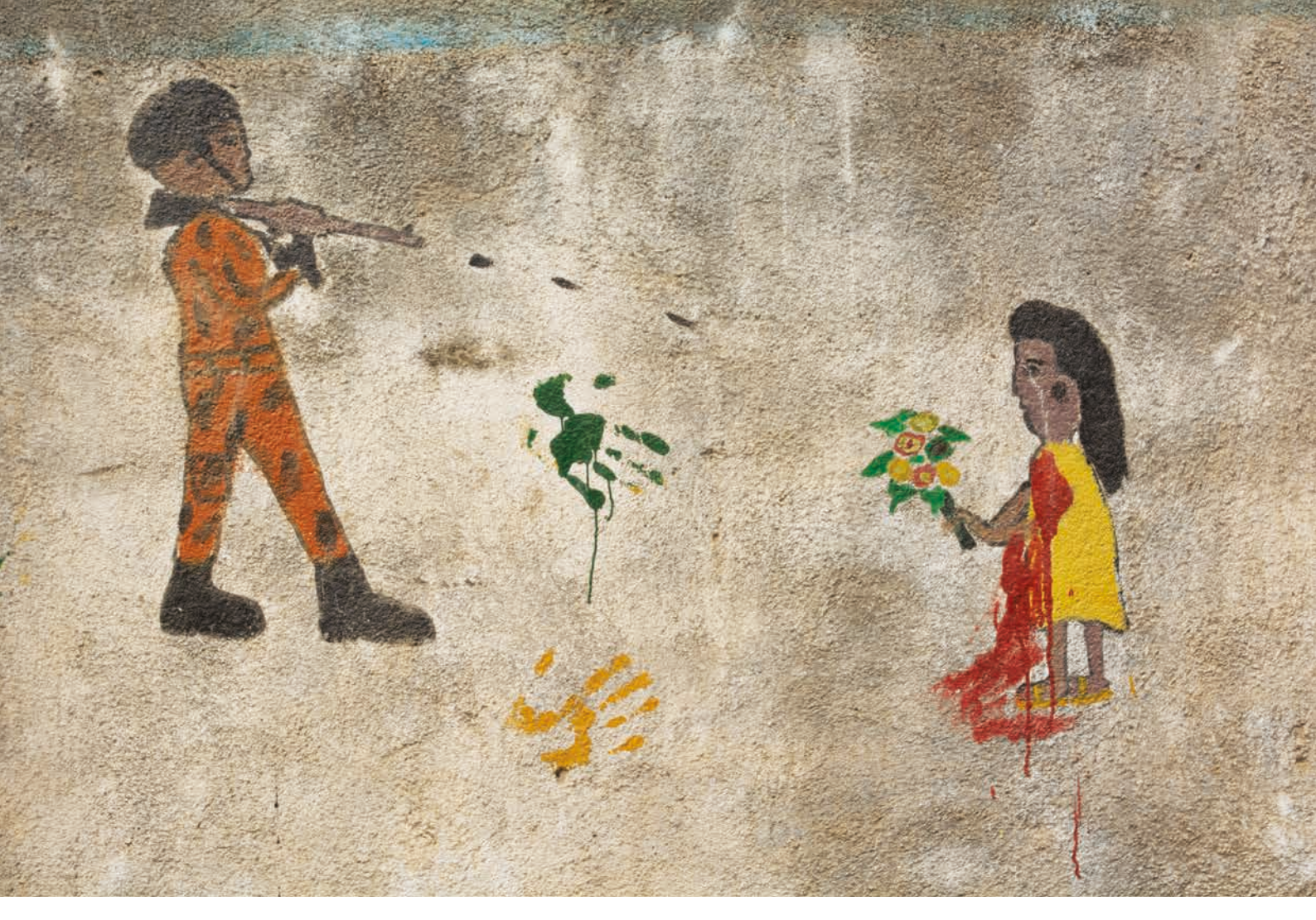
Revolutionary murals painted during the sit-in in Nyertiti, Central Darfur, in mid-2020.

Relations between SLA-AW and SRAC forces reportedly swiftly cooled, with the former requesting the latter to evacuate Jebel Marra rebel-controlled areas, which was done without violence in mid-2020. This may have been under pressure from Hemetti. While publicly rejecting talks with Hemetti, SLA-AW also established relations with him when he was a militia leader based in south-eastern Jebel Marra, long before he became the head of the RSF. SLA-AW has been recently successfully exploiting goldmines in that area and therefore requires peaceful relations with local RSF to be able to sell gold outside Jebel Marra.<sup>78</sup>