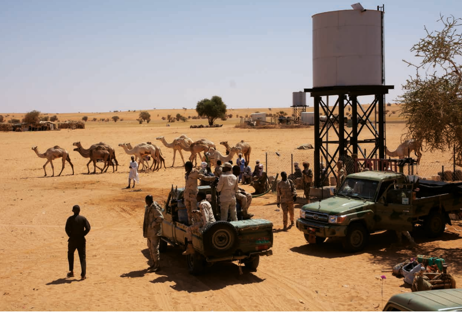
The RSF guard a desert water station where Hemetti's own camels are said to be watered, North Darfur, February 2021.