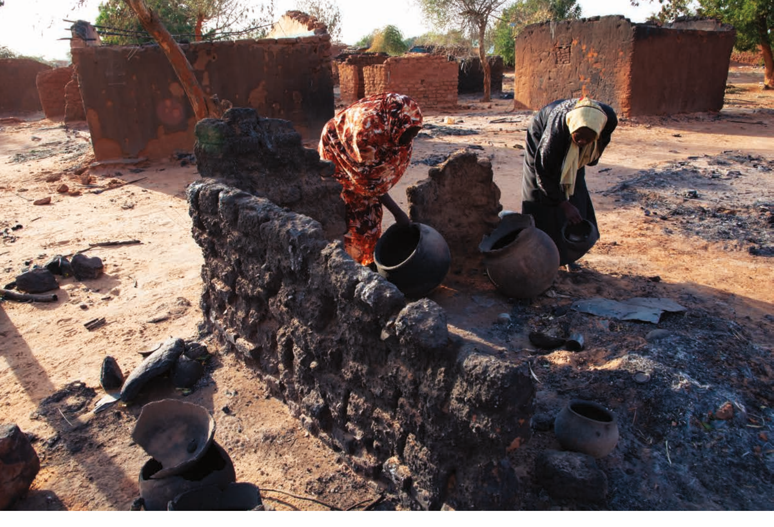
Displaced women visiting their houses burnt down in January 2021, Kirinding IDP camp, West Darfur, February 2021.

Masalit civilian armed with a "Goronov" (SGM-type) machine gun.<sup>11</sup> Although the perpetrator of the initial crime was arrested by the police, that evening, a retaliatory raid by 50 armed Arabs on five RSF vehicles reportedly killed four Masalit, including, randomly, three watermelon sellers on the camp's market, and intentionally, a policeman.