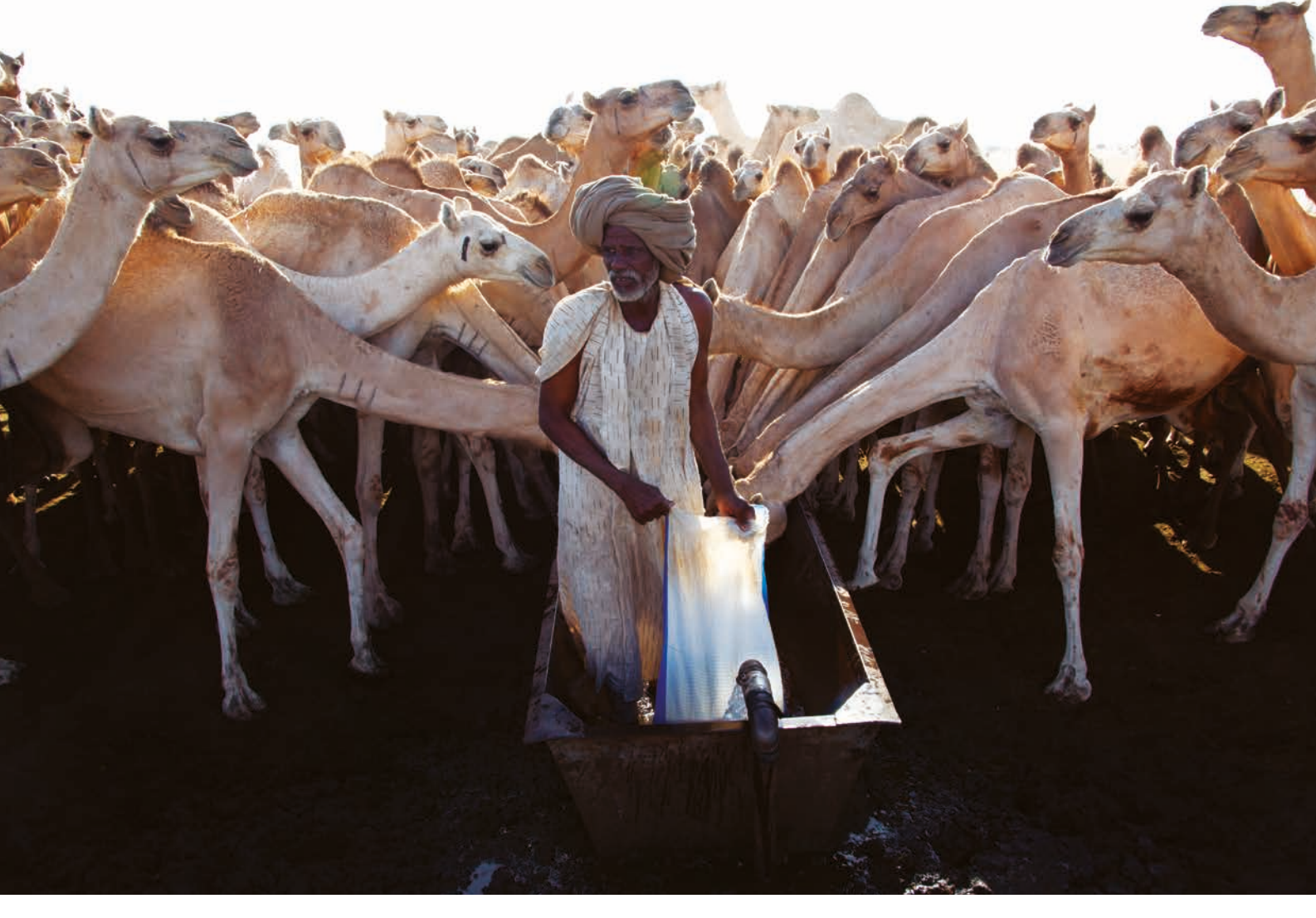
The Northern Saharan part of Darfur was controlled by rebels between 2013 and 2015. Then the RSF took control of the area and drilled water tanks for Arab camels. North Darfur, February 2021.