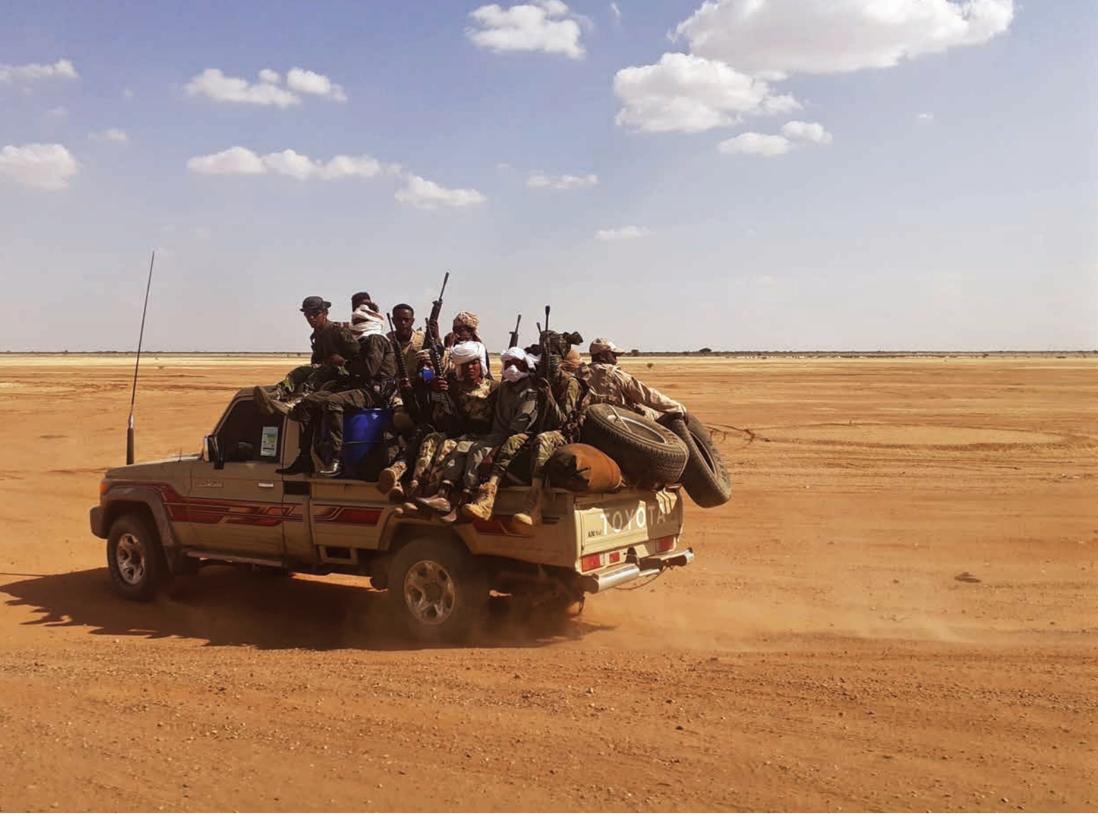
RSF patrol, October 2020.