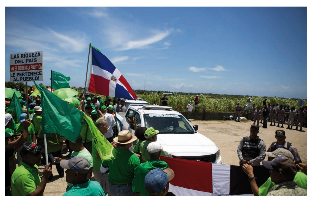
Demonstrations against the Punta Catalina Thermoelectric Power Plant