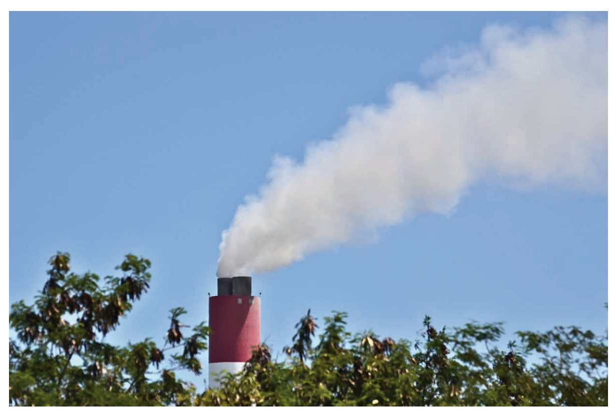
The chimney of the Punta Catalina Thermoelectric Power Plant emits toxic clouds of particulate matter and acid gases. March 20, 2021

The CTPC's annual air emissions blatantly exceed equivalent European Union ("EU") standards. The measurements analysed in the CTPC Pollution Study showed that the Plant releases an annual average of thousands of tonnes of particulate matter (PM _{\rm x} ), sulphur dioxide (SO _{\rm 2} ) and nitrogen oxides (NO _{\rm x} ), levels which are respectively seven, nine and two times higher than the levels defined as safe under EU standards. In the case of mercury (Hg), while European standards prohibit its emission, the CTPC releases an annual average of 122 kilogrammes.