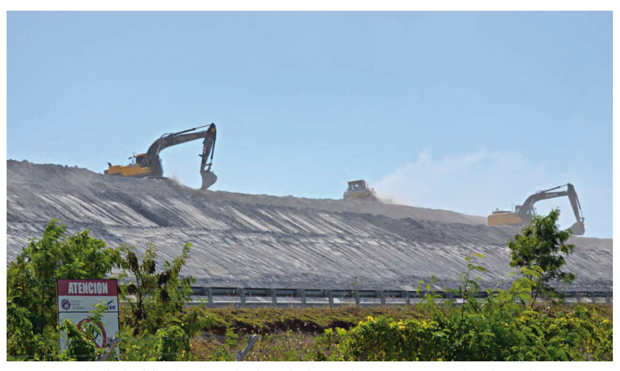
Mountains of toxic ash from the Punta Catalina Thermoelectric Power Plant. Batey San José, Peravia province. April 12, 2021

The inadequate management of toxic waste produced by the CTPC has led to the contamination of soil and water, both surface and underground, in the Peravia province. The monthly combustion of 160,000 tonnes of coal produces large quantities of ash, whose cumulative volume amounts to more than five times the fossil fuel incinerated. This waste is dumped outdoors and accumulates in three large mountains located in close proximity to the communities of Peravia and their food crops, and only two kilometres from the coast.