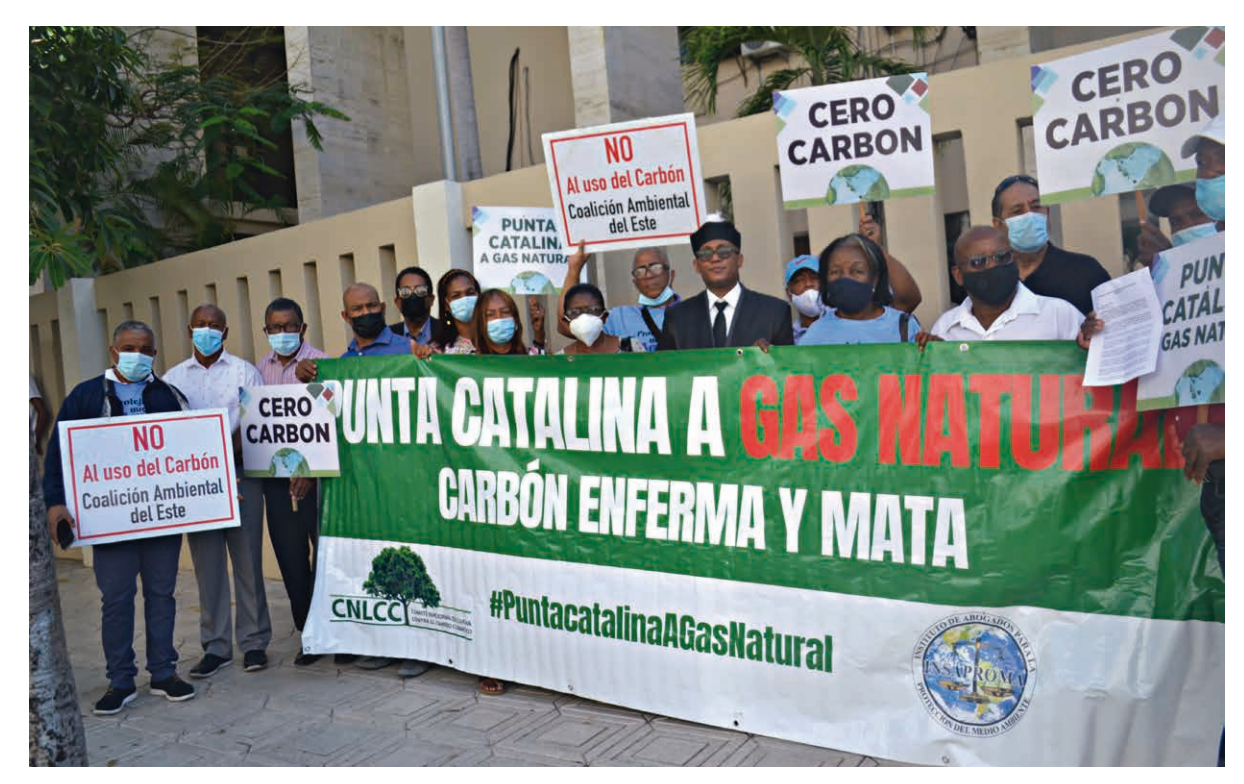
Demonstration before the Superior Administrative Court, after the filing of an injunction for the protection of the communities against the pollution caused by the Punta Catalina Thermoelectric Power Plant. Santo Domingo, April 27, 2021

In deciding on the construction of the CTPC, and its coal-fired operation, the state failed in its duty of due diligence to protect children from foreseeable and avoidable environmental harms and their cumulative long-term effects, such as climate change. The CTPC's massive coal combustion has not only produced widespread air pollution that has endangered the health, survival, and proper development of children today, it is also an activity that accelerates and perpetuates climate change, 113 and as such, threatens the health, well-being, and quality of life of children in the future. According to the Committee on the Rights of the Child, climate change is "one of the biggest threats to children's health and exacerbates health disparities", 114 and has serious and long-term implications for children's enjoyment of their rights.