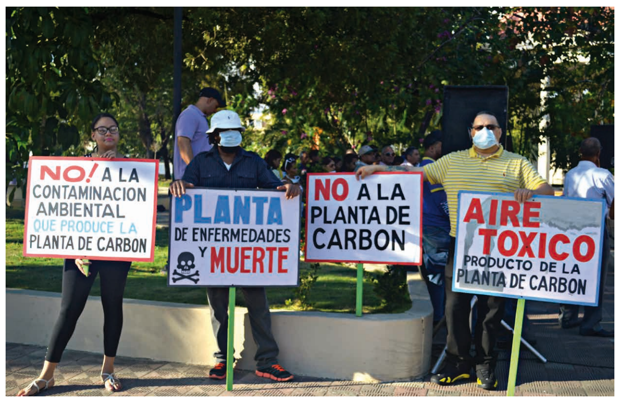
Demonstration against the construction of the coal plants of the Punta Catalina Thermoelectric Power Plant. Baní, Peravia province. January 26, 2015