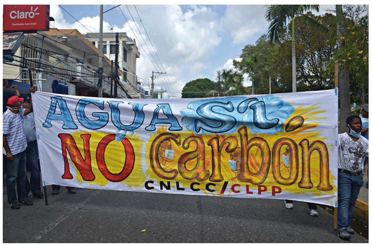
March «Water yes, Coal no». Baní, Peravia province. March 19, 2015

As a result of the uncontrolled release of toxic waste from the CTPC, it is highly probable that the water consumed by the inhabitants of the region, as well as the groundwater, is contaminated with heavy metals. Despite this evidence, managers at the Plant prevented the scientific teams in charge of the CTPC Pollution Study from establishing the extent of the environmental damage. As detailed in the study, the Plant's management did not authorise access to or sampling of groundwater in the ash yard at the Plant.<sup>141</sup>