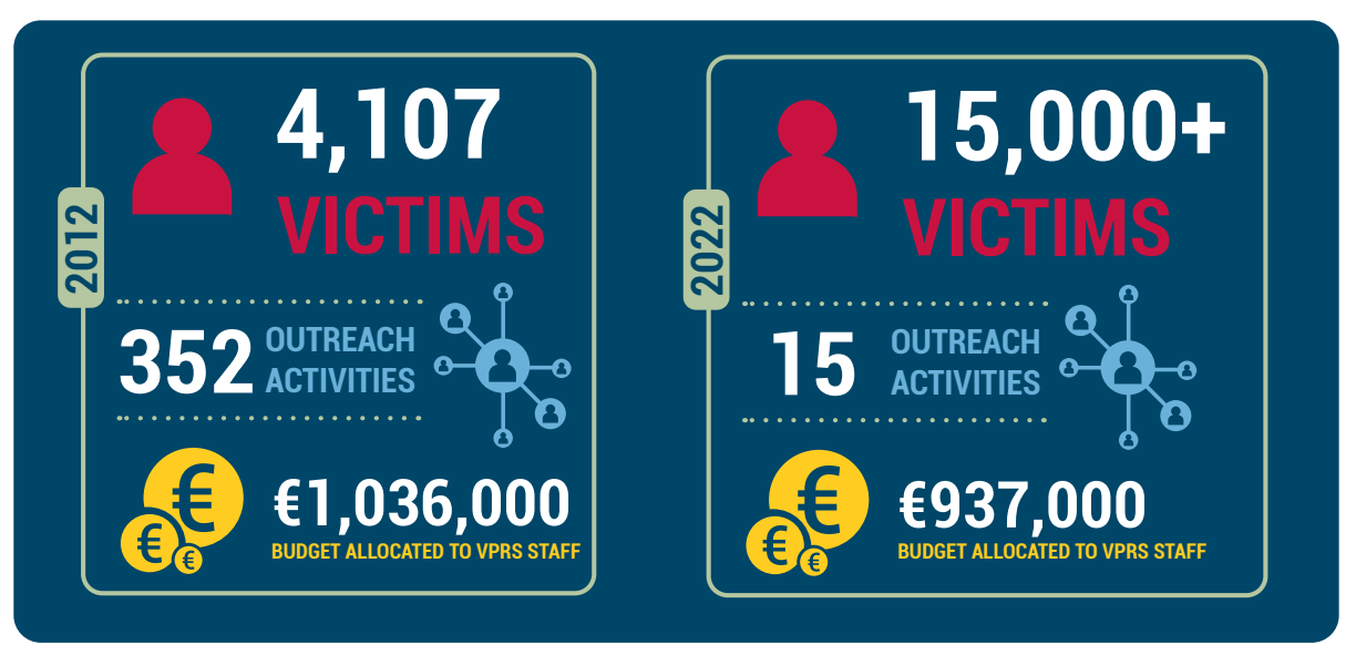
Numbers extracted from publicly available data on ICC website and in ICC documents

Numbers speak volumes: there are now fewer ICC staff members dedicated to victims' support and outreach than a decade ago, despite the increase in the number of situations and cases. For instance, the Victims Participation and Reparation Section (VPRS), both at headquarters and incountry, has experienced a substantial reduction in resources. As of 31 August 2012, 4,107 victims were participating in ICC proceedings, and that year the approved budget for VPRS staff was EUR 1,036,000. In terms of outreach and public information the Registry reported that an impressive 352 activities were organised from January to August 2012, including interactive sessions with affected communities and radio and television broadcasts in several situation countries. Skipping forward a decade, a combined total of over 15,000 victims participated in cases before the Court from 2022-2023, representing over three times the 2012 figure. However, the approved budget for VPRS staff in 2022 was only EUR 937,000, almost EUR 100,000 less than the 2012 budget, without factoring in inflation. The Court's website only reports 15 outreach activities in 2022.