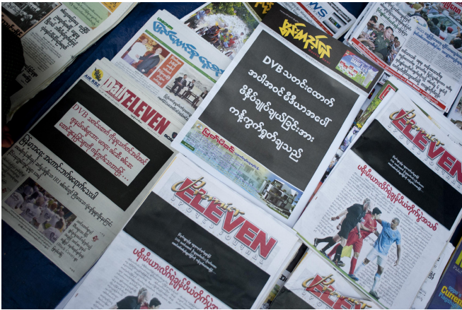
Newspapers with a black front page (L) are displayed at a stall in Rangoon on April 11, 2014, after the conviction of a Democratic Voice of Burma journalist on charges of trespassing and “disturbing a civil servant”.

Almost 58% of the political parties selected the amendment or repeal of the 2014 Printing and Publishing Law as a step to improve media freedom.