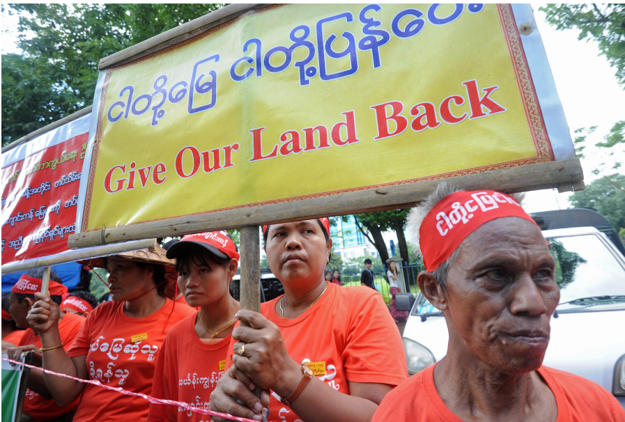
Landless villagers hold placards during a protest against land confiscation in Rangoon on September 23, 2013.

Responses showed that there was no clear preference for one particular measure that political parties would take to limit the negative impact that development, investment, and infrastructure projects could have on local communities.