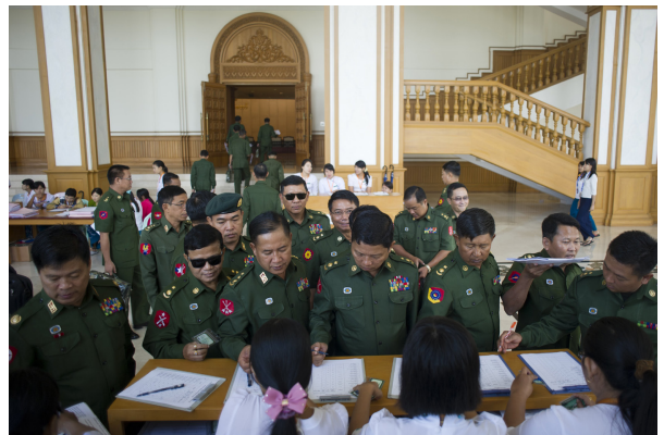
Military-appointed MPs sign registration book at Parliament in Naypyidaw on August 25, 2015.

No constitutional amendment to reduce the role of the military in Burma's civilian affairs received consideration by a majority of the political parties. More than 47% of the political parties wanted to amend Article 20 of the Constitution in order to bring the military under civilian control. Almost 37% favored amendments to the Constitution to reduce or eliminate the 25% parliamentary quota for military-appointed MPs. About 26% favored amending Article 232 of the Constitution to make civilians eligible for the positions of ministers of Defense, Home Affairs, and Border Affairs.