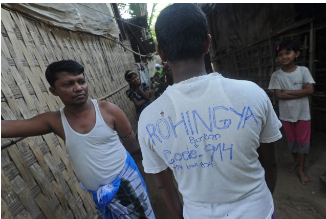
Internally displaced man (C) wears a t-shirt with “Rohingya” written on it during a census at an internally displaced camp at Theechaung Village, Arakan State, on April 1, 2014.

Only 26% of the political parties wanted to abolish criminal defamation (Articles 500 and 501 of the Criminal Code) and just 21% planned to repeal the 1923 State Secrets Act. In July 2014, five media workers from the Unity weekly news journal were sentenced to 10 years in prison each under the State Secrets Act.