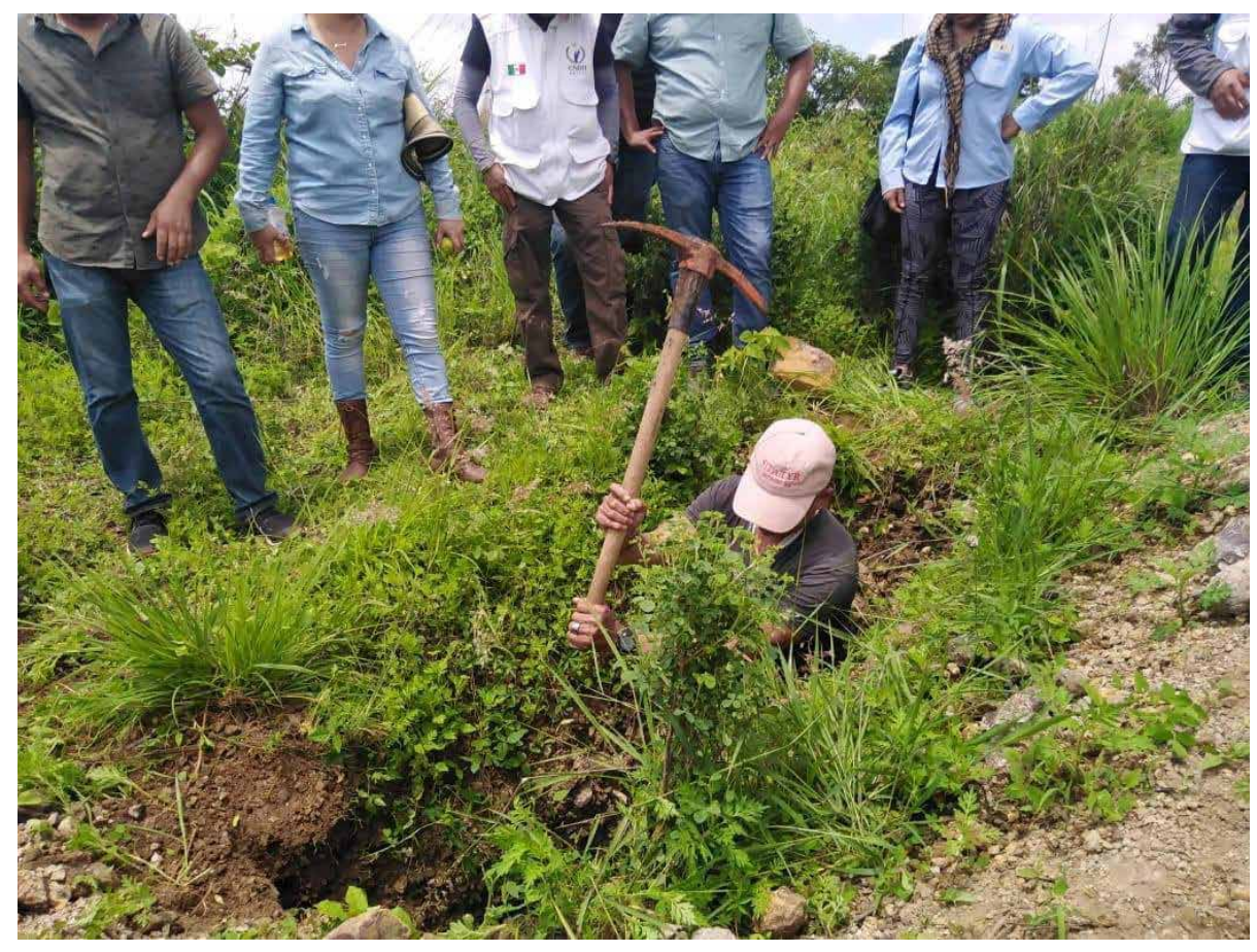
Collectives of family members of disappeared persons uncover a clandestine grave.

The events described in the report, in which acts of enforced disappearance were committed, form part of a broader wave of violence which, as explained in the context section, escalated with particular intensity in June 2017, following the elections that led to Sandoval's election loss. In this broader context of violence, between 120 and more than 300 disappearances were reportedly committed.<sup>251</sup> In relation to these disappeared persons, as of November 2020, 140 bodies have been found in clandestine graves located in the State of Nayarit.<sup>252</sup> The description of each of these events indicates, with respect to the 47 victims of enforced disappearance described in this report, those whose bodies were found in clandestine graves located in the State of Nayarit between 2018 and 2019.