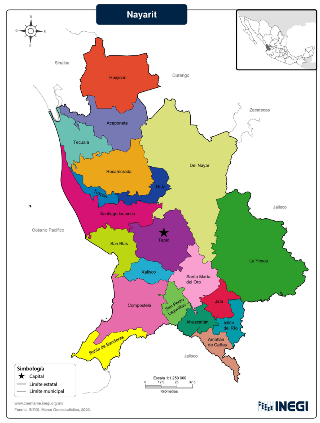
Map of Nayarit.

As is the case with all Mexican States, executive power is vested in a Governor, whose mandate lasts six years.<sup>7</sup> In turn, executive power in each of the 20 municipalities of Nayarit is exercised by municipal presidents (mayors), who serve for three years.<sup>8</sup> The legislative power is the State Congress, which is renewed every three years and is composed of 30 deputies.<sup>9</sup> The judicial power is vested in the Superior Court of Justice – composed of 17 magistrates – and the courts established by law; magistrates are appointed to 10-year terms and may be reappointed only once for the same 10-year term.<sup>10</sup>