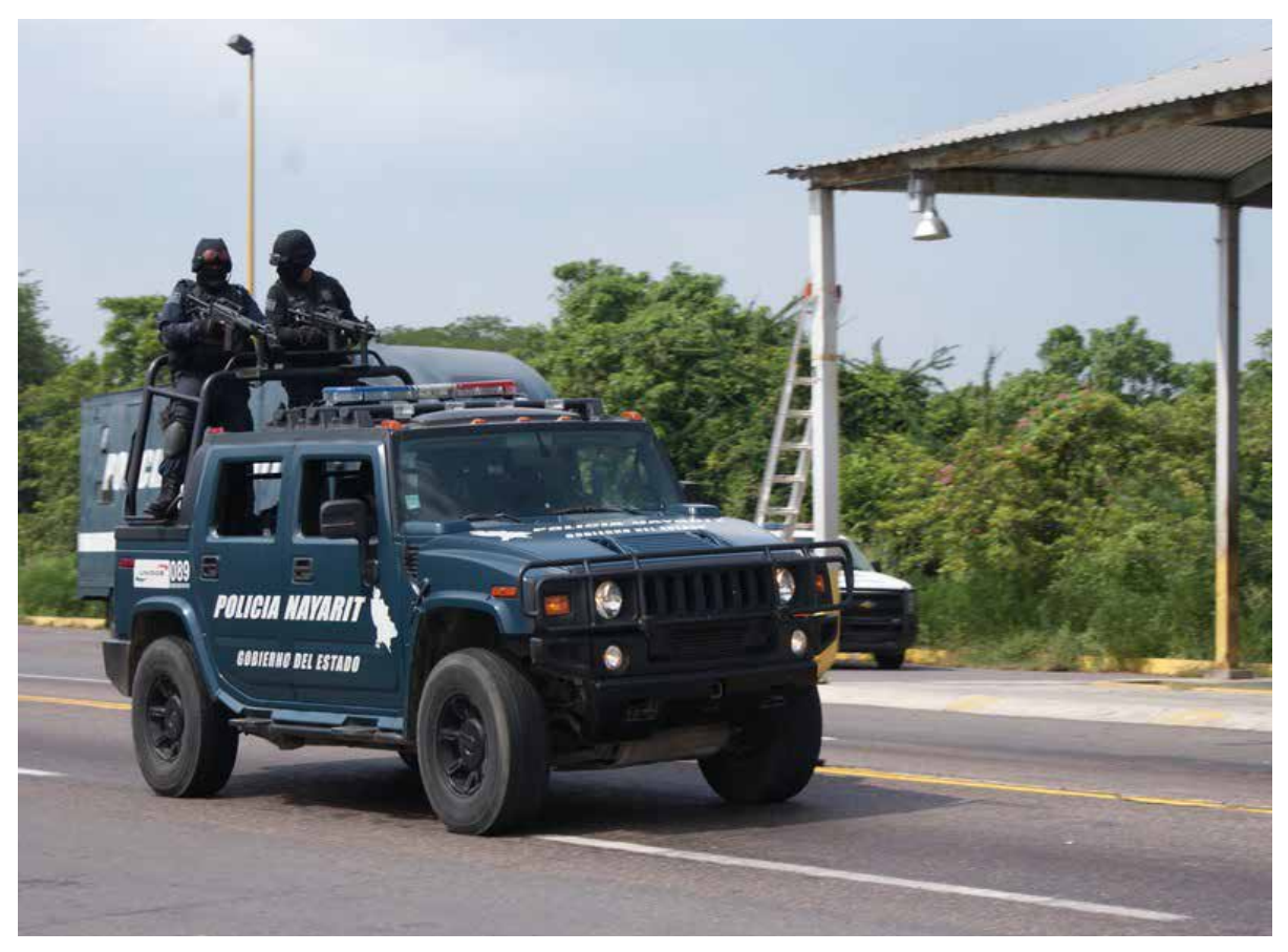
Hooded officers on top a vehicle of the Nayarit police.

(including Nayarit Police Force uniforms and helmets, uniforms with the Mexican flag, Nayarit Public Prosecutor's Office uniforms, and brown uniforms with the "Investigation Agency" logo); and various firearms or weapons. In each of the 26 events, according to witnesses, the State and its security forces were involved. In all 26 events, witnesses expressly recognised the involvement of the Nayarit Public Prosecutor's Office; vehicles of the Nayarit Public Prosecutor's Office or the Nayarit Police Force; or the presence of State Police motorbikes. The at least 47 persons who were forcibly disappeared were loaded onto vehicles of State entities and thereafter no information was ever provided on their whereabouts. In at least five of the 26 events, witnesses further indicated that the armed men who abducted the persons who were forcibly disappeared were wearing uniforms of the Nayarit Public Prosecutor's Office or uniforms of the Nayarit Police Force. Also, in at least six of the 26 events, witnesses identified commanders or officials of the Nayarit Public Prosecutor's Office or police commanders in the vehicles, and in at least two of the 26 events, the armed men identified themselves to the witnesses as police officers.<sup>299</sup>