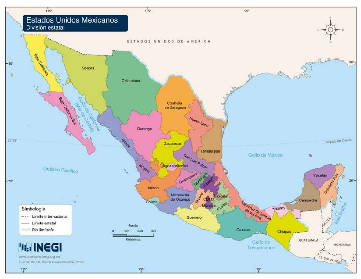
Map of the federal states of Mexico.

Located on the west coast of Mexico, Nayarit is one of the country's 32 States. It borders the Pacific Ocean and the State of Sinaloa to the west; the States of Sinaloa and Durango to the north; the States of Durango, Zacatecas and Jalisco to the east; and Jalisco and the Pacific Ocean to the south.