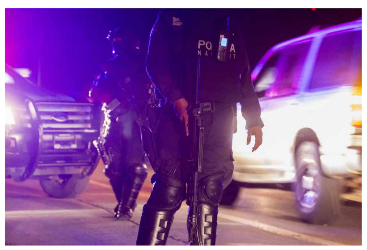
The Nayarit police during the operation in Puerto Vallarta, 2016.