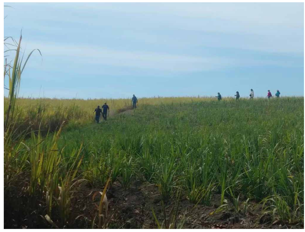
Collectives of family members of disappeared persons search for clandestine graves

findings are stunning: from June 2017 through May 2020, at least 30 clandestine graves containing at least 140 bodies were found in various Nayarit municipalities.<sup>213</sup> In many cases, it is family members themselves who uncover clandestine graves in Nayarit, often facing indifference or lack of action on the part of State authorities.<sup>214</sup> Thus, although most of these graves were found after Roberto Sandoval Castañeda had left office in September 2017, the families of the victims of enforced disappearance have declared that justice has yet to be served for the crimes committed. When clandestine graves are found, the Nayarit Public Prosecutor's Office does not conduct impartial or efficient investigations, even after the departure of Veytia and Sandoval. Indeed, in certain cases, the Public Prosecutor's Office even attempts to intimidate and impede the efforts of the families of the disappeared persons.