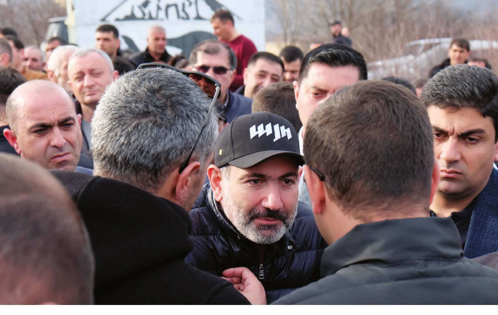
Prime Minister Nikol Pashinyan during a visit to Amulsar in 2020.