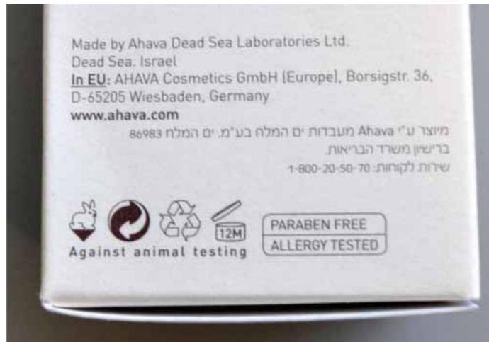
▲ The company Ahava labels their products "Made in Israel", despite the fact that they are manufactured in a settlement in the occupied Palestinian territory. The postal Code 86983, shown in tiny characters on the packaging, is the postal code for the Israeli settlement Mitzpe Shalem by the Dead Sea.