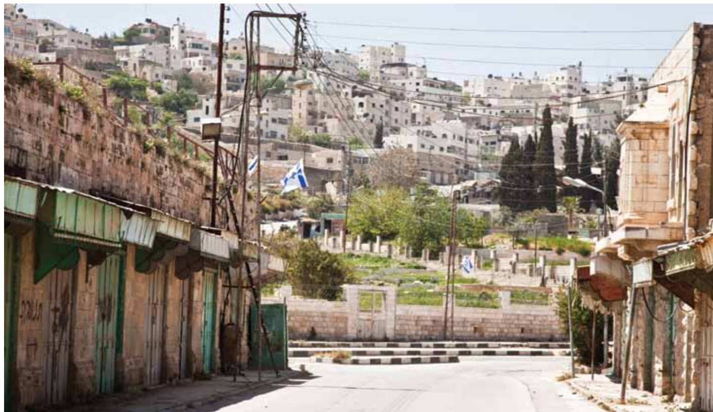
▲ Some streets in the old centre of Hebron are now off limits to Palestinians due to the presence of settlers in the centre of the city. Streets such as this were once busy markets but are now empty.