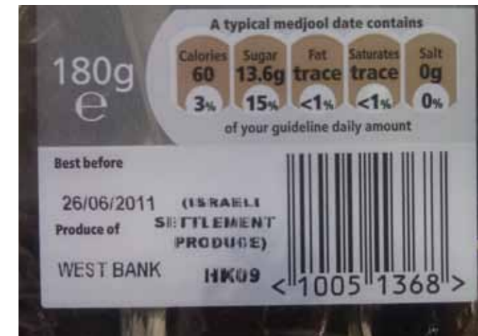
▲ Dates on sale in the UK. In accordance with the labelling guidelines introduced by the UK government in 2009, the label clearly states that it is “Israeli settlement produce”.

Danish FM Villy Søvndal announcing labeling guidelines. 154