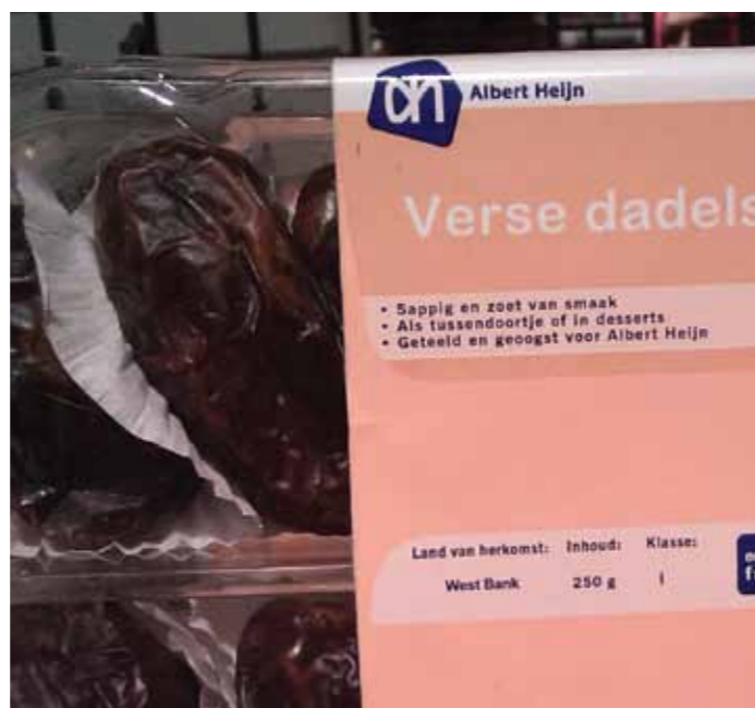
▲ Dates on sale in the Netherlands. The label reads "West Bank" which leaves the consumer unclear whether the fruits are from Israeli settlements or from Palestinian producers. After enquiry, the seller explained the dates were from Tomer settlement in the Jordan Valley.

The main Israeli exporter of dates is the company Hadiklaim. Hadiklaim appears to mark all dates as Israeli produce, making it difficult for the consumer to distinguish between dates from Israel proper and from the occupied Jordan Valley.