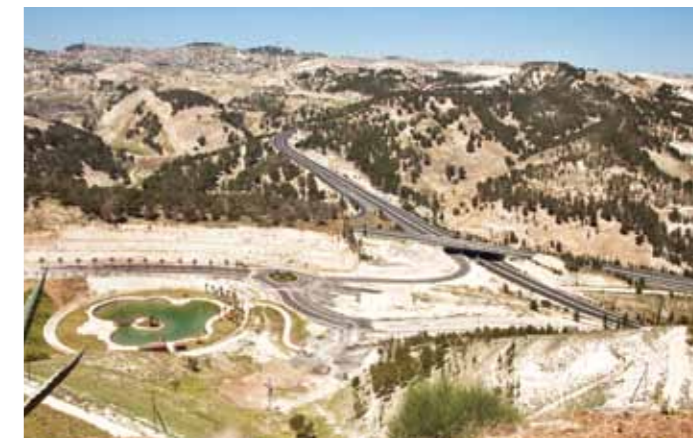
▲ An Israeli settlement on the outskirts of East Jerusalem. Settlements are being constructed around the city, cutting off Palestinian East Jerusalem from the West Bank. Despite widespread water shortages in Palestinian communities, many of these settlements boast swimming pools and water features.

Access to East Jerusalem also remains a major problem. Israel obliges any Palestinian who does not have residency rights in Jerusalem or Israeli citizenship to apply for a permit through a complicated and time-consuming process. This is also the case for medical patients accessing Palestinian hospitals in East Jerusalem. 19% of patients and their companions in the West Bank who applied for healthcare access in 2011 had their permits denied or delayed. 33 In a vast majority of ambulance transfers, patients must be moved from a Palestinian ambulance to an Israeli ambulance at a checkpoint before entering Jerusalem. 34