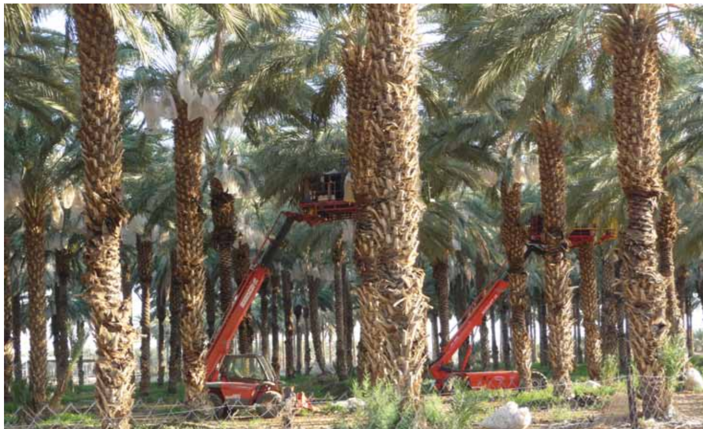
▲ Palestinians harvesting dates in Tomer settlement, Jordan Valley.