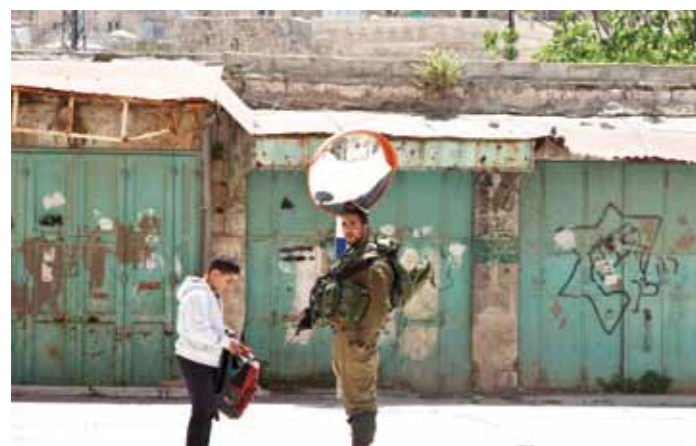
▲ Israeli soldier searches boy's school bag in Hebron.

Settlements are Israeli communities established on territory occupied by Israel since the 1967 Arab-Israeli war. Settlements are supported by an infrastructure including special roads, checkpoints, and the separation barrier dividing them from the surrounding Palestinian population. Settlements violate international law and UN Security Council resolutions and yet, throughout the 45 years of Israel's occupation of the Palestinian territory, every Israeli government has promoted continued settlement expansion.