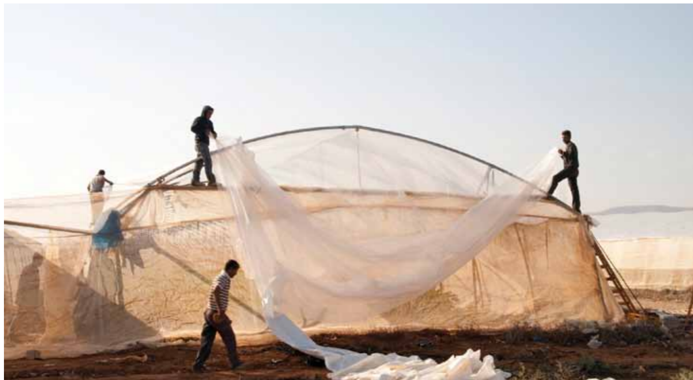
▲ Palestinians construct a greenhouse on an Israeli settlement farm in the Jordan Valley.

Water cisterns used by Palestinian farmers to collect rainwater are frequently demolished by the Israeli authorities (46 in 2011 alone), further limiting their ability to grow crops. 43 In addition, a growing number of water springs on Palestinian land in the vicinity of settlements have been taken over in recent years by settlers who have subsequently blocked Palestinian access to them. 44