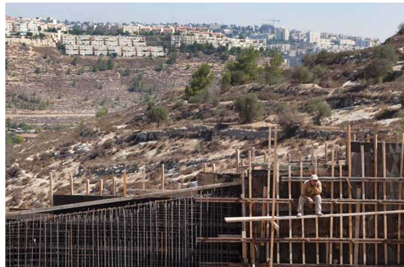
▲ The construction of the Wall in the Palestinian village of Al Walaje which has been surrounded by thousands of settlement units in the Gush Etzion bloc.

Through the establishment of settlements, Israel has created a discriminatory two-tier regime in the West Bank with two populations living separately in the same territory under two different systems of law. While settlers enjoy all the rights and benefits of Israeli citizens, Palestinians are subject to a system of Israeli military laws that deprives them of their fundamental rights. 17