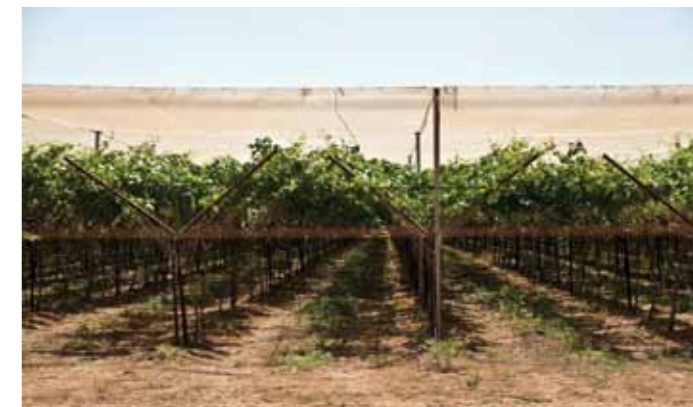
▲ Vineyards that form part of an illegal Israeli settlement in the Jordan Valley in the West Bank, built on confiscated Palestinian land.

Settlements have established modern agribusinesses and industrial zones that produce high value goods for export to the EU and international markets. This is partly due to the special incentives provided by the Israeli government.