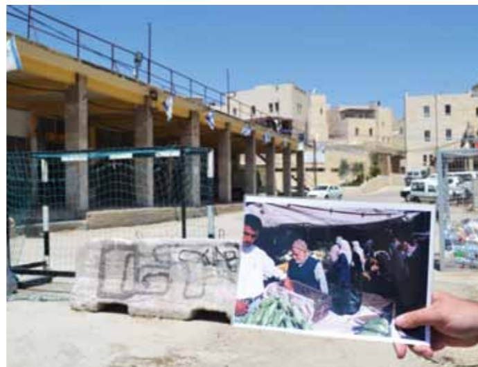
▲ A photo contrasts life in a busy Hebron market in 1999 and life on that street today. The old centre of Hebron has been closed to Palestinians, turning the city into a ghost town.

Obstacles to movement of goods: While settlers enjoy easy and direct access to Israeli and international markets, all Palestinian goods destined for Israel or further export must pass through Israeli checkpoints where they are unloaded from Palestinian vehicles and extensively checked before they can be re-loaded onto an Israeli vehicle on the other side (the so-called ‘back-to-back’ system). This is extremely time-consuming and often damages the products. Palestinian goods destined for international markets then pass through Israeli port and airport terminals where they face further disadvantages, obstacles and excessive time delays. All these obstacles significantly reduce the competitiveness of Palestinian products and increase the unpredictability of their delivery times and quality. 85