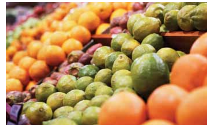
▲ Citrus fruits being sold in a supermarket.

The discrepancy is largely driven by Israel's generous incentives for settlement businesses and the crippling restrictions imposed on the Palestinian economy described in the preceding chapter. By importing vastly more from settlements that are taking advantage of the occupation than from producers living under the occupation, Europe is helping entrench the discriminatory two-tier system in the West Bank.