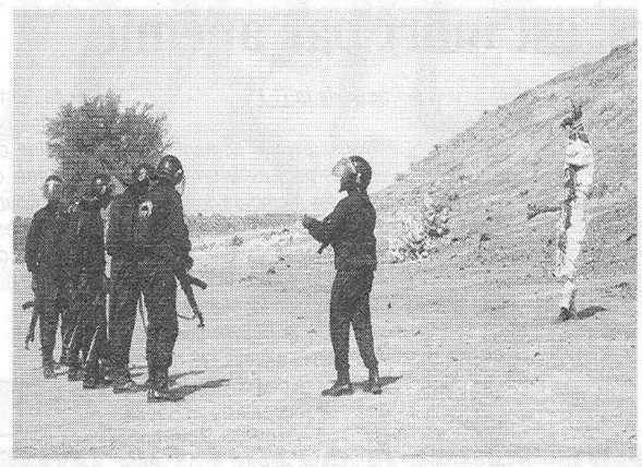
Après l'exécution, la vérification des balles dans les chargeurs

«Dans ces conditions, sa condamnation est exécutoire. La loi est dure, mais c'est la loi. Le peuple tchadien l'a voulu ainsi pour que la