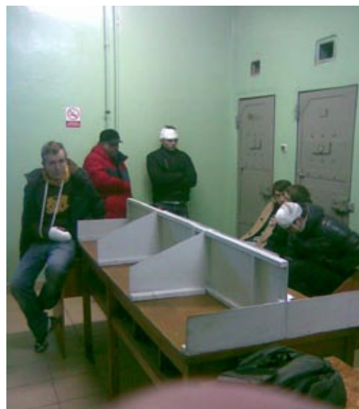
Okrestina Detention Center, December 19, 2010.

Demonstrators and people arrested on the square that were interviewed by the Mission described the same scene: overloaded police wagons, long - sometimes hours-long - waits in the courtyard of the pretrial detention facility, the night of December 19-20 spent in the corridor, where the detainees were arranged along the wall due to lack of space in the cells.