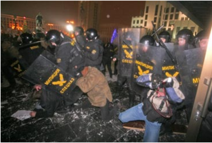
Journalists under the blows from Special Forces clubs, December 19, 2010.

the Minsk metro, as Minister of Information Oleg Proleskovsky announced at a seminar in Hrodna for the heads of the republic's media outlets. Commenting on his Ministry's filing a suit with the Supreme Economic Court to end publication of these newspapers, Oleg Proleskovsky said that this was "the right of the Ministry and, as minister, my personal position." "That they dared to help some politicians dance on bones after the terrorist attack - there won't be any forgiveness for things like that," he stressed, adding that the question of whether these newspapers would continue publishing or not would be resolved by the court, "which is how it should be in civilized countries." 57