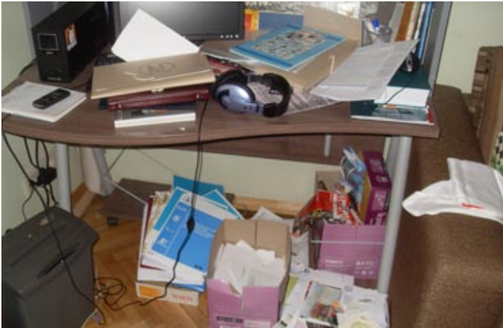
Human Rights Center Viasna office after it was searched, January 17, 2011.

and Responsibility of Individuals, Groups and Organs of Society to Promote and Protect Universally Recognized Human Rights and Fundamental Freedoms (Declaration on Human Rights Defenders), adopted by UN General Assembly resolution 53/144 on December 9, 1998. Our position in regards to Article 193.1 of the Criminal Code, which stipulates criminal responsibility for activities in a nonregistered organization and which may be applied to Ales Bialiatsky and other members of the “Viasna” Human Rights Center, is unequivocal: banning such activities and holding people liable for them contravenes both the Constitution of our country and international instruments ratified by the Republic of Belarus, specifically the International Covenant on Civil and Political Rights. Application of Article 193.1 of the Criminal Code is evidence of the grossest violation by the Republic of Belarus of the freedom of association and remains the permanent object of criticism by influential international organizations, including the OSCE and the United Nations.