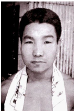
HAKAMADA Iwao at his youth