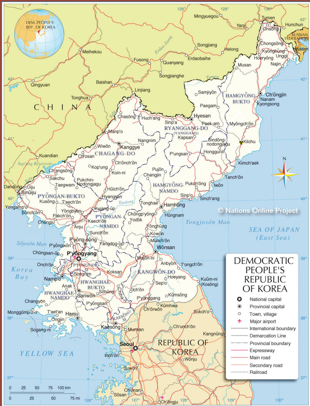
Map of the Democratic People's Republic of Korea Nations Online Project ©